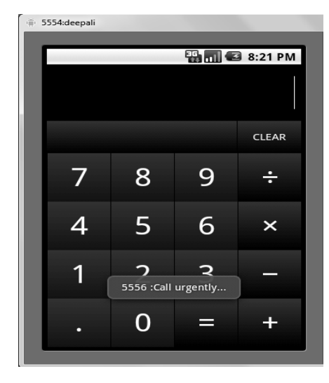
Fig. 8: The ongoing task is interrupted when the SMS is received from High Priority Contact. This SMS is flashed on the screen so as to notify the user. This High priority SMS is stored in default inbox as well as in the priority inbox designed for storing the important SMS received from the High priority contacts.