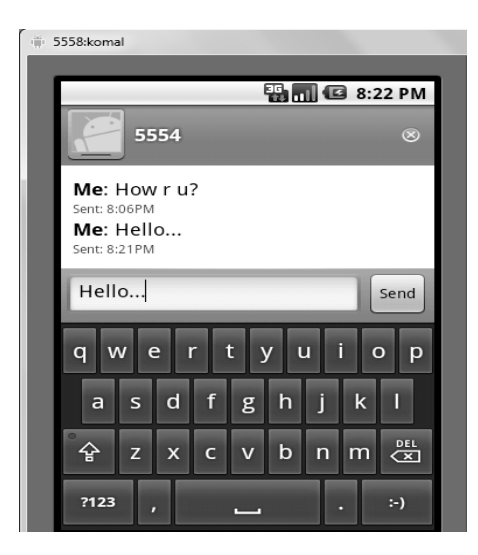
Fig. 5: Default Priority contact typing the SMS which is to be sent