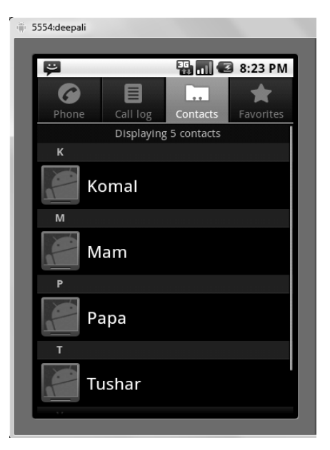
Fig. 3: Contact List saved in mobile phone

From the available list of contacts in mobile phones, few contacts which are important can be set as High priority contacts. Android's Emulator has been used for the experimental purpose. Emulator is a virtual mobile device that runs on the computer. The emulator allows developing and testing Android applications without using a physical device. In the following figures, the numbers like 5554, 5556 etc. resemble the 10 digit contact numbers present in the mobile phone's contact list.